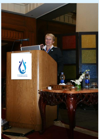
Session Launching: A keynote