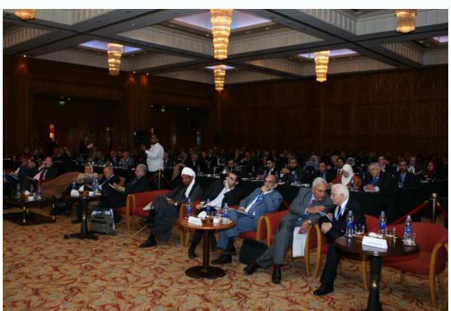
Highlight: Broad interaction with audience